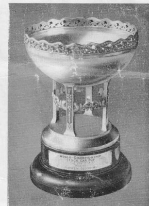
The 1962 World Championship Stock Car Cup. Sponsored by: W. D. & H. O. WILLS.