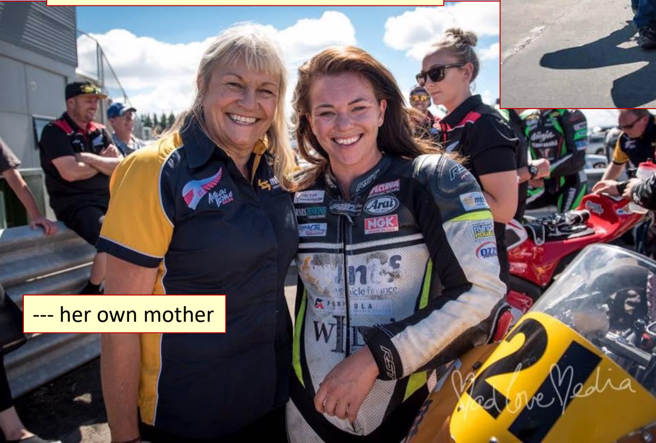
--- her own mother