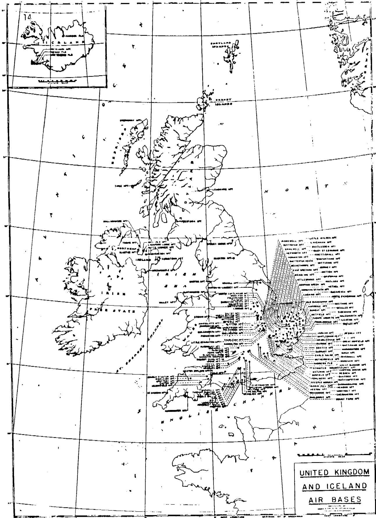
Fig. 2. Flying facilities, 1945